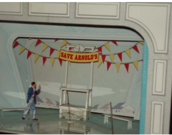
Set model by Scenic Designer Walt Spangler