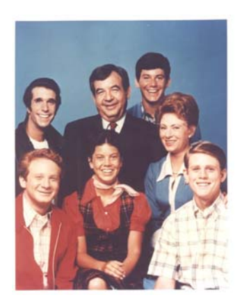
Happy Days Cast

TV had proven to be an extraordinarily powerful tool of communication and dissemination of ideas. Today, we'd probably be witnessing such events streaming live on the internet or being fiercely debated in the blogosphere. It's definitely a smaller world, than that of the typical TV sitcom family of the 50's.