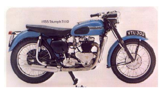
1955 Triumph T110